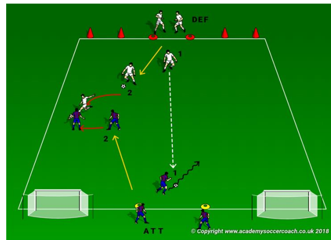
Diagram 2. Introduce a ball to each player so they can start to use skill moves to create an advantage. Encourage different skill moves and ask players to demonstrate their skills to the group.

Players set up as diagram shows, defenders where the gates are, attackers start at the end with the goals. Defender plays into attacker and defends as normal. Attacker will attempt to beat the defender and dribble through either of the two gates at the end of the field. Points are rewarded for every successful dribble through the gates by the attacking team. Rotate once each player has had 2/3 attempts. Shown with players 1. Coaching points, attack the space, use skill moves to beat the defender, dribble at pace once the defender is beaten. Progression. For defending players, if they win the ball can they get the ball into either goal. Talk about when they have won the ball can they then play out. The attacker then has to win the ball back and attempt to beat the defender through skill. As shown with players 2.